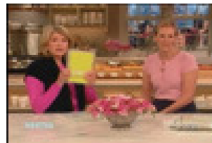
The Martha Stewart Show