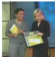
Good Morning America